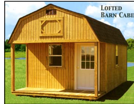
LOFTED BARN CABIN